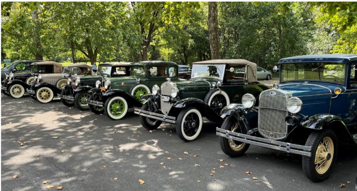
The line-up of attendees at the Post-Sully picnic