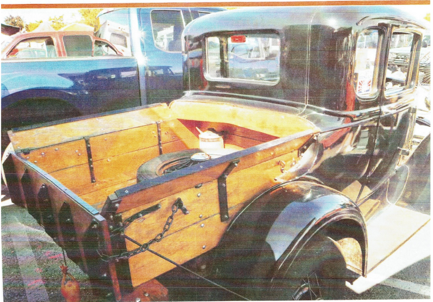
A rear three-quarter view of the ration truck shows that it's plainly not an everyday Model A pickup.

"I contacted him right away," he continued, "and I said, 'You've got a ration truck.' He said, 'Ration truck?' I said,