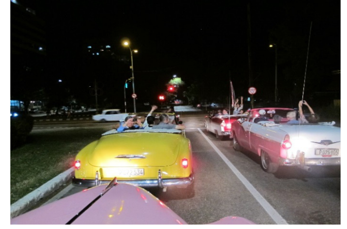
We are not tourists and we are not having fun!

from the restaurant back to the hotel when Nathaly said, "Why don't we just take these taxis?" We'd been set up! There were several 50's convertibles surrounding us. The trip back was somewhat more than five miles, I think we toured most of Old Havana, and a little faster than the speed limit, if there was one. What a way to end a tour!