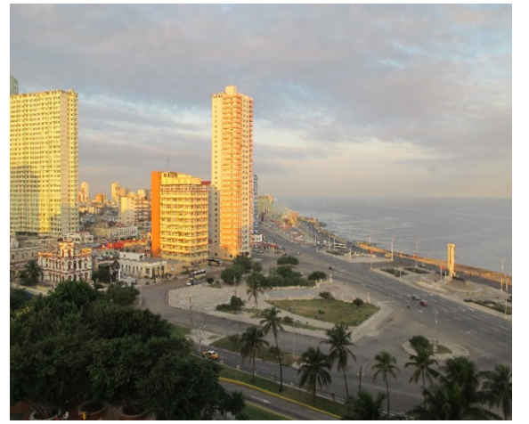
December 8, 2016 at 7:45 am on the Malecon. (Main road along Havana Harbor.) Count the cars and think D.C.