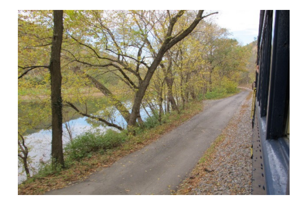
Going through the Trough.