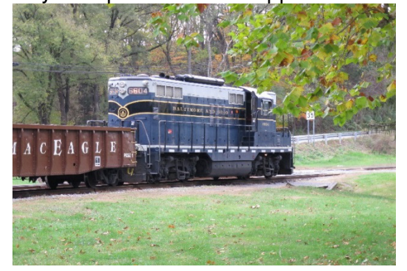
Our Engines, the one on the right was lead.

too many cookies for desert. As we arrived back in Romney, the rain that had been forecast finally made a showing and we got a bit wet getting to our respective cars. Still, it was a very enjoyable weekend and all