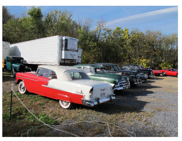
Some of the tour cars. The '55 is my favorite.