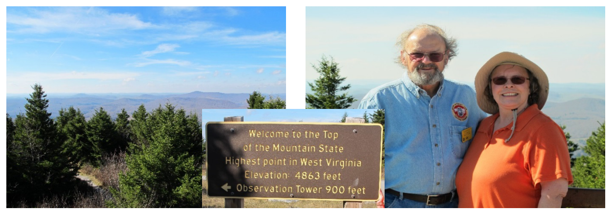
The view from the top of Spruce Knob. Someone needs a haircut!

from the tower at the top of the hill were fantastic. After Spruce Knob we headed back to the restaurant to regroup. On the way down, Carol and I were on our own and about half way down we