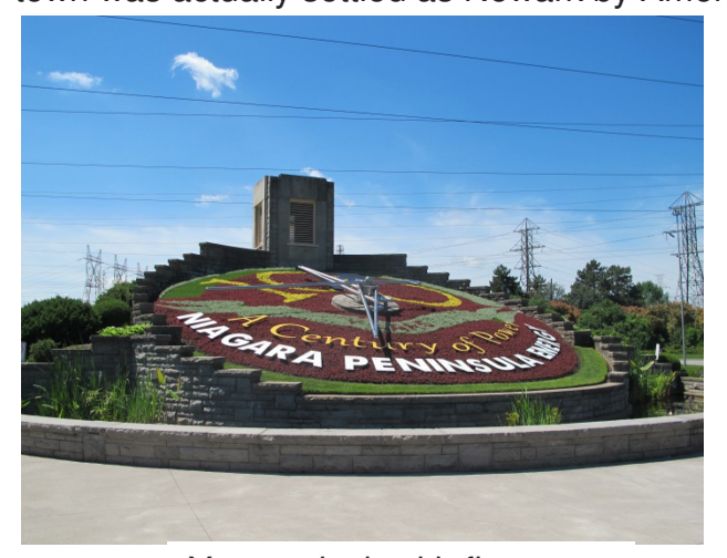
Yep, a clock with flowers

By 10:00 more Model A's were arriving and the sidewalks were beginning to be rolled out, so we wandered the town, took a few pictures and visited a few stores. We found out later that the town was actually settled as Newark by American Loyalists who fled the Revolution and was the