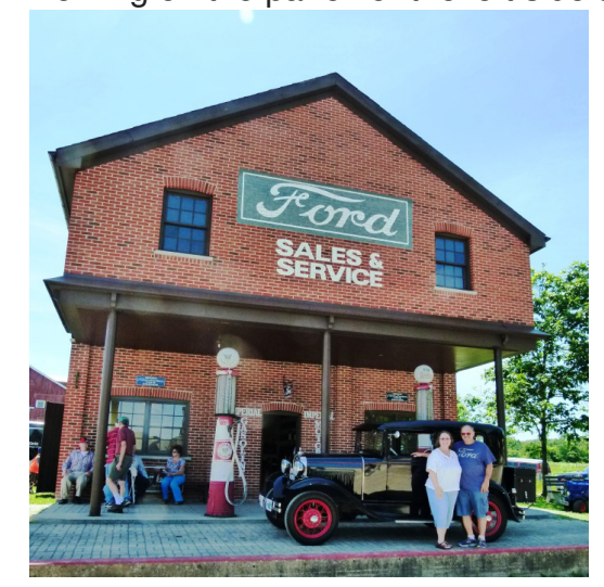
From Ford's in the park, ain't we pretty?

I should mention the three seminars I attended. The first was on KR Wilson tools. It was quite informative and I did capture a couple of good handouts. The second was listed as the restoration Model A fenders. In actuality it was about moving metal. The gentleman that presented the seminar spent three hours demonstrating tools and explaining how to remove dents, he just used a fender 'cause they are most often dented and easy to carry around to seminars. I learned a great deal and only hope I can remember some of what I learned. The last seminar was on how to install upholstery. Again the presenter was an expert who had been in the business with his father for quite a while. And again, I hope I can remember some of the things he talked about. One story he related I found very interesting. In their shop they actually make their own panels and have patterns for all Model A's. He and his father were working on a Tudor and he had handed his father a panel to curve between the right side window and the rear window. It didn't fit! His father told him that the panel was a half inch too short. He was working on the panel for the left side so he finished it before cutting a new panel for the right.