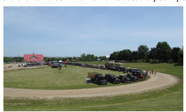
A's and T's in the Park

Our only problem was that Garmie, which we were using at the time, wanted to take us on a toll road that required electronic identification. Fortunately I read the sign and we bypassed that problem but we ended up going back and forth on the QEW trying to find the right place to get off. We finally "picked one" and got lucky 'cause it took us right to Milton. The next day we drove over to Fords in the Park on a beautifully sunny and almost cool day. There were Fords