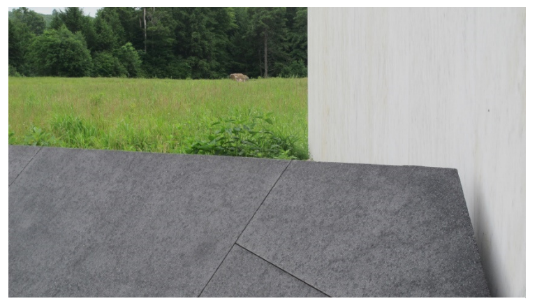
Looking down the Wall to the impact site

The first day wasn't too bad as the rain confined itself to a mist and the Rain-X allowed us not to use Cricket's vacuum windshield wiper, which wouldn't have worked well in the hills anyway. We did manage a stop at the Flight 93 National Memorial not too far from Somerset in Pennsylvania. Seeing the memorial for the first time was equally impressive, saddening and very emotional all at the same time. And it brought back old memories. On September 11th 2001. I was headed from work to a customer location not too far from the Pentagon. As I was driving down Interstate 66 inside the Beltway I started being passed by black unmarked cars with lights and sirens blazing. When I got to the customer's, the building had been evacuated and I was told to return home as the Pentagon had been struck by and aircraft. It was not until I got back to my office that the full extent of the event became clear. Carol knew I was going to see a customer that day and thought I was going to the Pentagon. She started calling the office as soon as she knew that the attack had occurred. My boss grabbed me as soon as I got back and had me call home to let Carol know I was okay. I do not particularly like to remember that day. My last Air Force assignment was at the Pentagon and although I did not know anyone lost in the attack there, it is still somewhat chilling to think about the deaths and devastation. The Flight 93 Memorial consists of The Wall of Names with 40 panels each containing the name