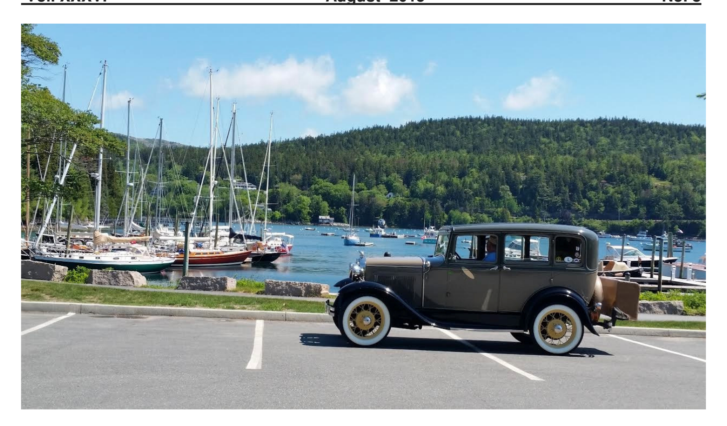
A beautiful scene in Maine.