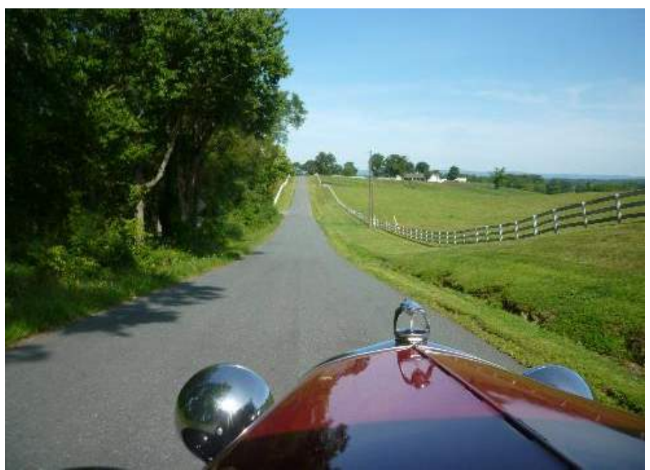
My window on the past on the Snickersville Turnpike

The War took its toll on the turnpike. The Goose Creek Bridge was burned, and after the war, only the westernmost five miles were in a condition to merit payment for passage.<sup>1</sup>