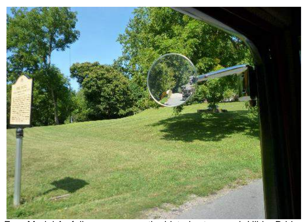
Four Model As follow me across the historic stone arch Hibbs Bridge