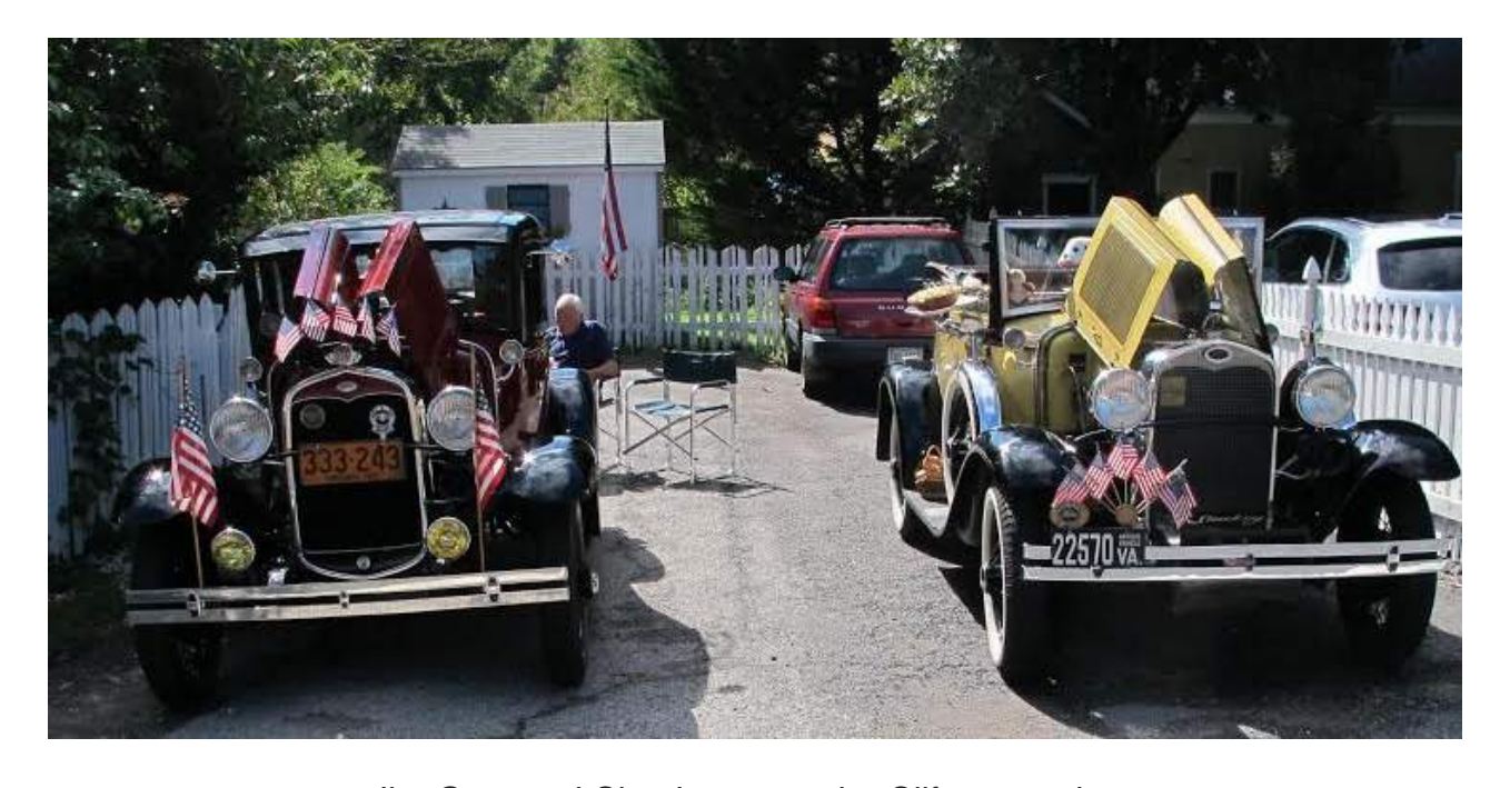
Jim Gray and Clem's cars at the Clifton car show