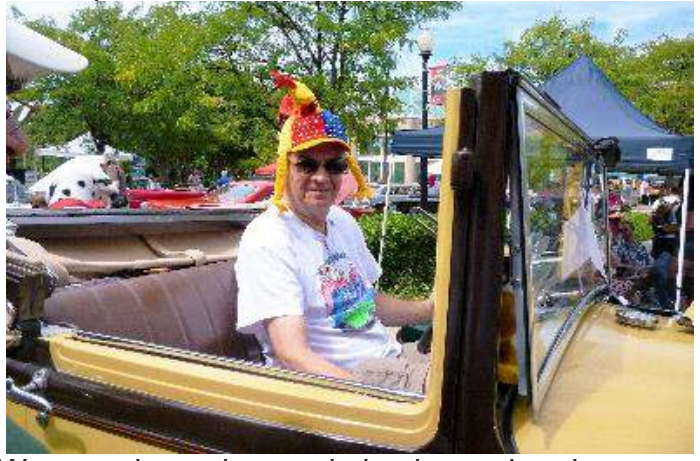
We experienced a good-sized crowd and many cars, but unfortunately both the car and spectator turnout was much smaller than last year. Maybe my chicken hat chased 'em away; but we had a nice time all-around anyway.