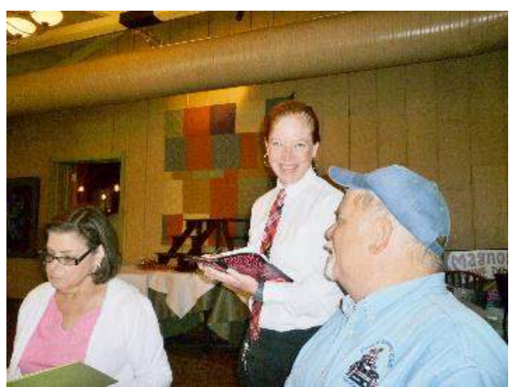
After the machine shop tour, we enjoyed lunch in the party room at Magnolias in the Mill.