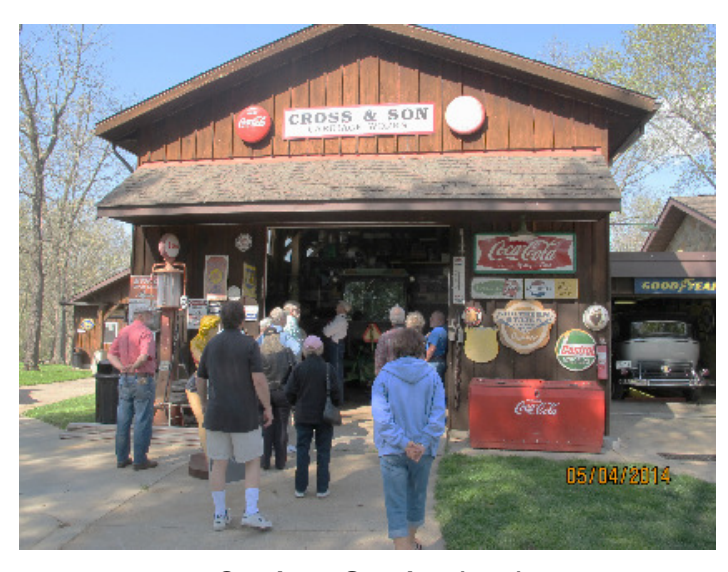
Carriage Service (Sims)