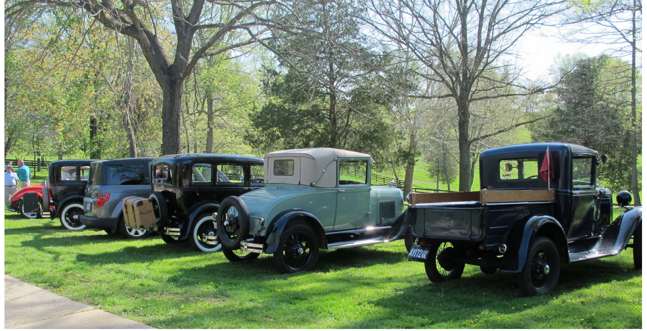
Model A's parked at the pastoral Cross Farm