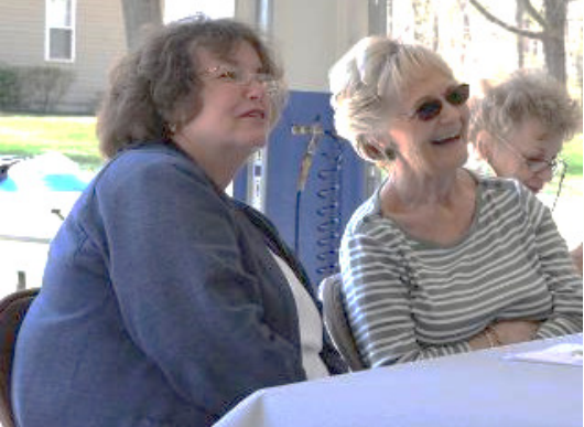
But the ladies are really better at it