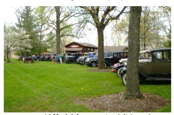
14 Model As came to visit (J. Gray)