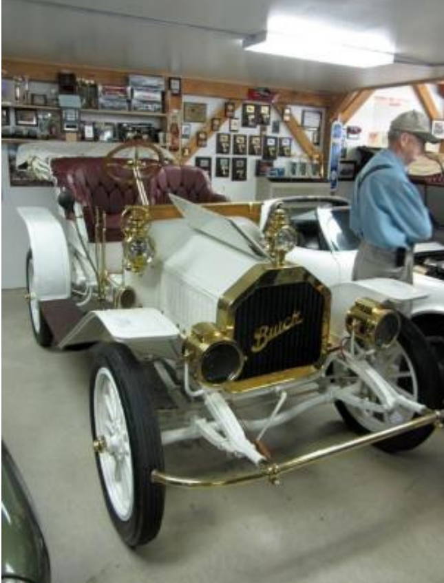
'11 Brass era T (Leydon)