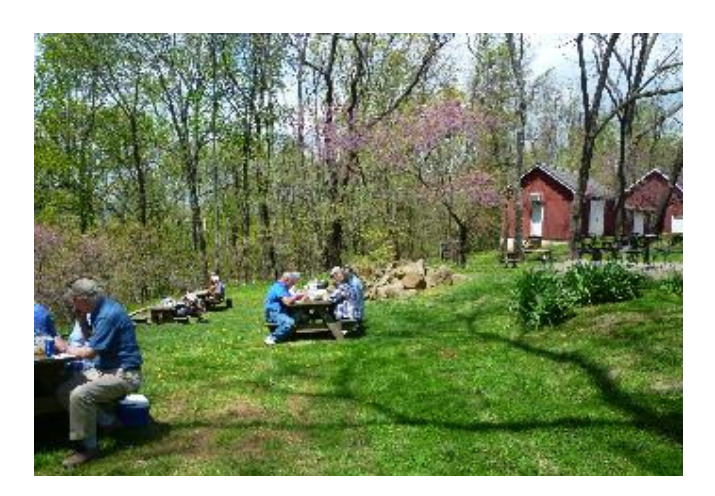
Our bucolic picnic (J. Gray)