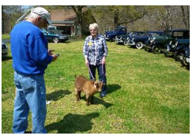
Sharon preferred Blossom, the pygmy goat