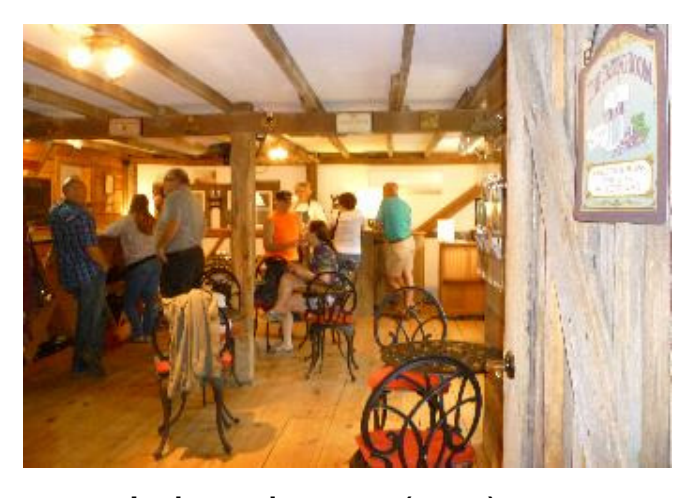
In the tasting room (K. Gray)