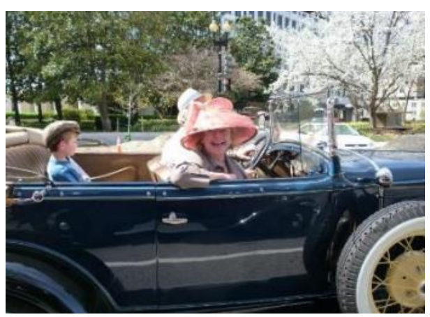
Rande: "Aren't Gold Cup hats just GRAND?!"