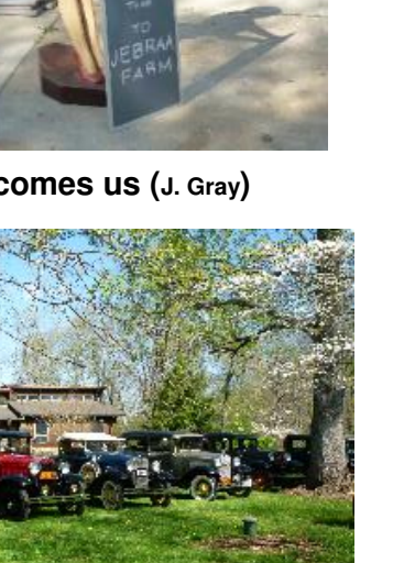
Beautiful weather (J. Gray)