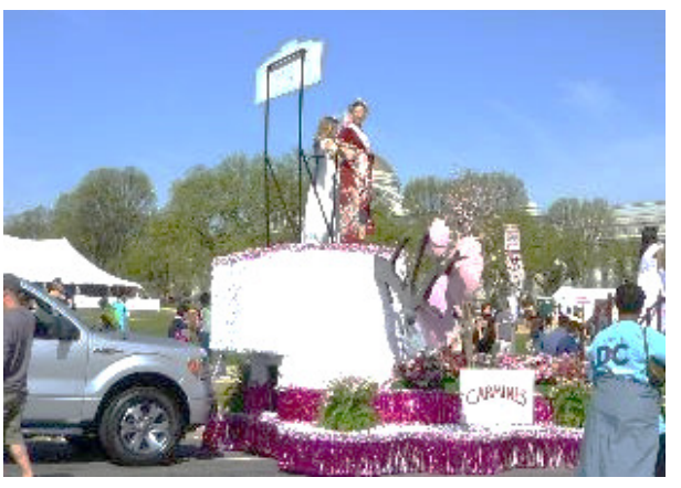
The American and the Japanese queens get ready 19 May 2014