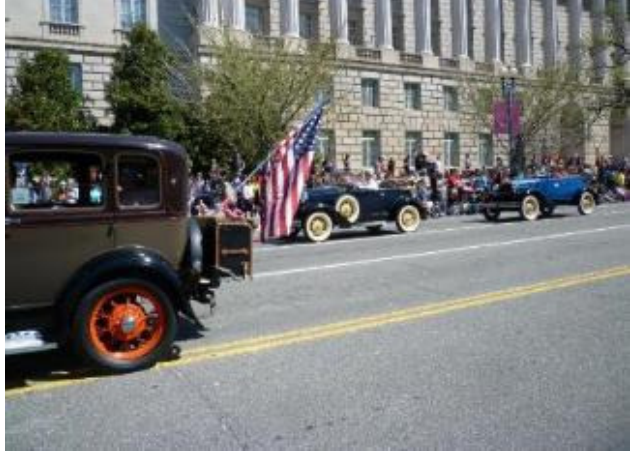
We bring Old Glory to the parade!