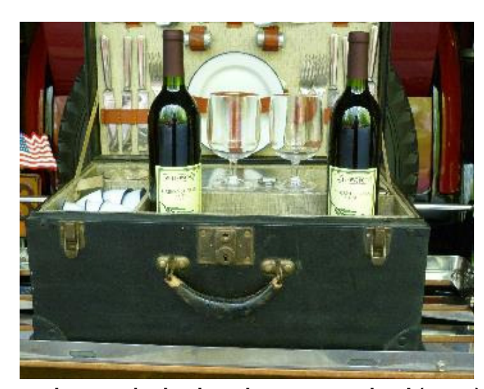
...my vintage picnic chest is now complete! (J. Gray)