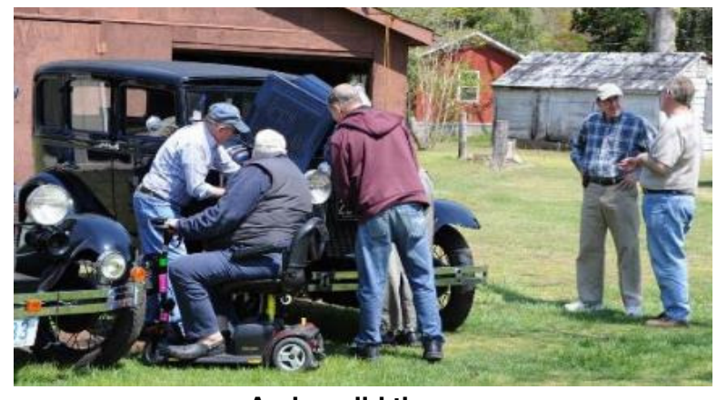
And so did the guys