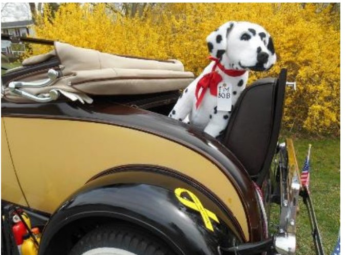
Good bye 'till next year! Bob will be back on April 11, 2015... will you? Here's a little more about the parade, including two links to YouTube videos that show our cars. The first just shows a glimpse: <a href="http://www.youtube.com/watch?v=nwiSUqKQR8Q">http://www.youtube.com/watch?v=nwiSUqKQR8Q</a>, but is accompanied by this great history of the Festival:

"Each year, the National Cherry Blossom Festival commemorates the 1912 gift of 3,000 cherry trees from Mayor Yukio Ozaki of Tokyo to the city of Washington, DC. The gift and annual celebration honor the lasting friendship between the United States and Japan and the continued close relationship between the two countries.