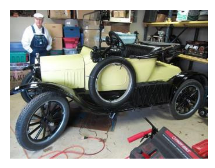
'22 T Coupe with Rocky Mountain Brakes (Leydon)