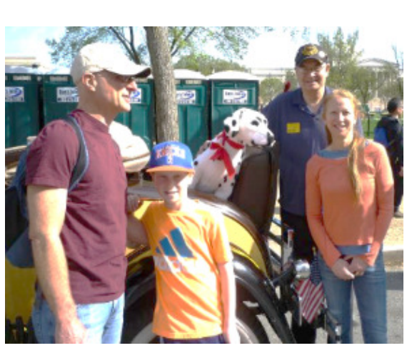
"Bob" gets a name