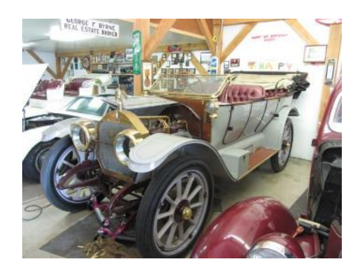
A '12 40hp Pierce-Racine-Case; you sit on the gas tank! (Leydon)