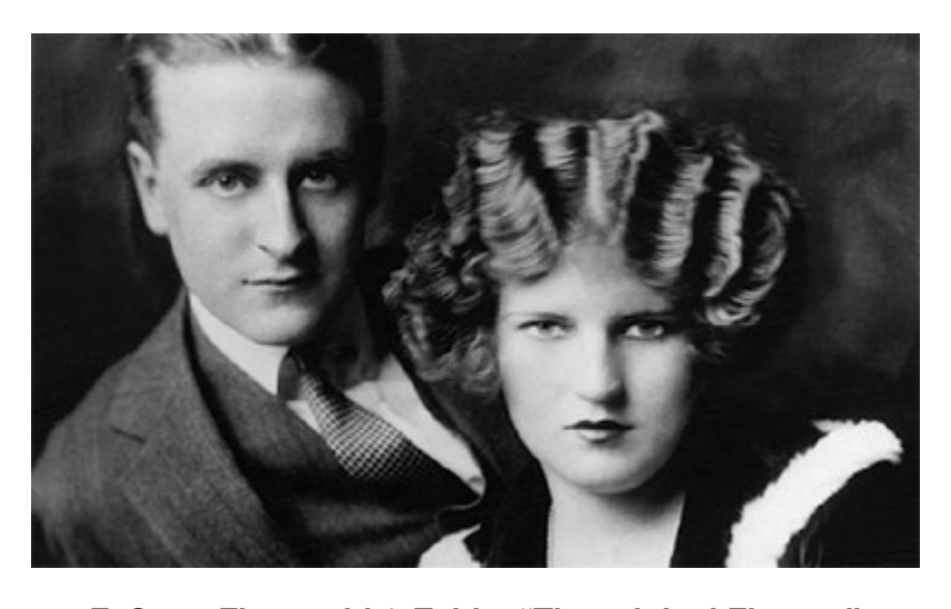
F. Scott Fitzgerald & Zelda, "The original Flapper" (Caption by author)

http://www.mosbyheritagearea.org/news.html