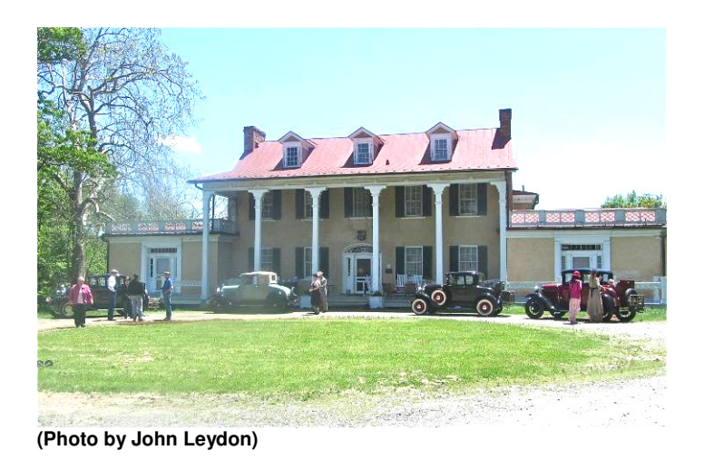
Our Model As at Welbourne

Hearing their wild honking in your mind as you turn, you wonder what the ruckus is about - when you suddenly notice it's two great baying fox hounds announcing your drive through a broad meadow to the main house. Realizing you're going to stay - like the other ancient cars parked in semi-circular formation - the hounds suddenly bound off to announce the next arrival. Welcome to Welbourne.