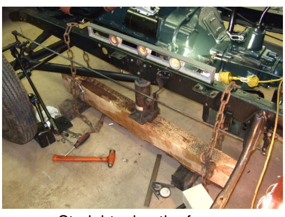
Straightening the frame.