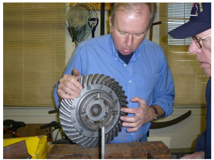
Dave's new high-speed 40-tooth ring gear