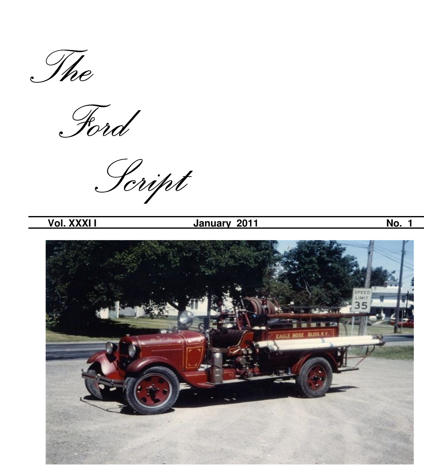
Mike French's 1929 Buffalo Model AA Fire Truck (See p. 10 for story)