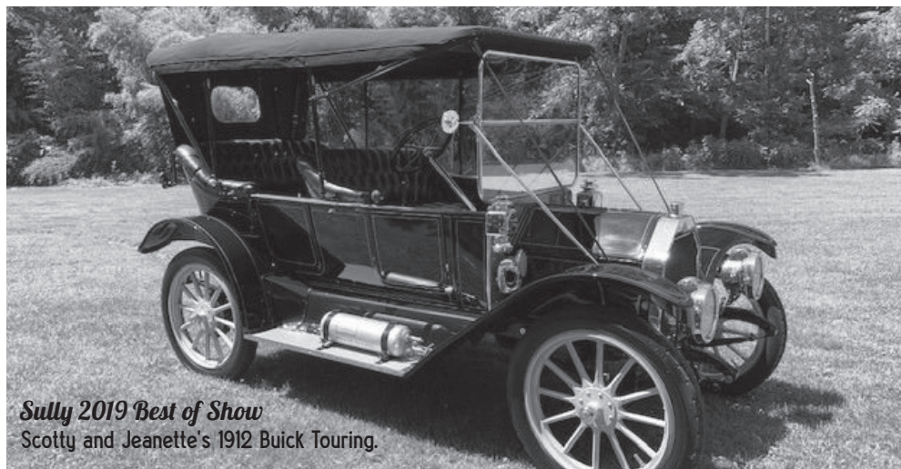
Sully 2019 Best of Show Scotty and Jeanette's 1912 Buick Touring.